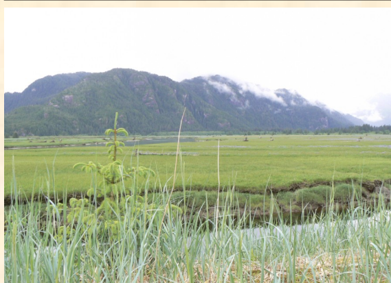
Bradfield Canal, near the planned Alaska-Canada Intertie route

The Alaska-Canada Intertie is vital to ensure the economic feasibility of the development of over 3000 Megawatts of possible power at 80+ developable sites in Southeast Alaska alone.